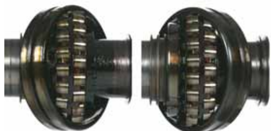
COMPETITOR B AVE BEARING RATING 3.0 DELTA KV @ 40°C 49%

With high steam pressures and increasing speeds, the stability of your paper machine lubricant is critical. Mobil DTE PM Series keeps bearings and return lines cleaner, helping maintain flow rates and protect bearings. As shown in the photos above, this keep-clean performance is demonstrated in a proprietary Bearing Rig Test (scale from 0 to 10; the higher the rating, the cleaner the bearing).