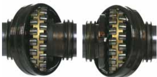
MOBIL DTE PM SERIES AVE BEARING RATING 6.5 DELTA KV @ 40°C 4.9%